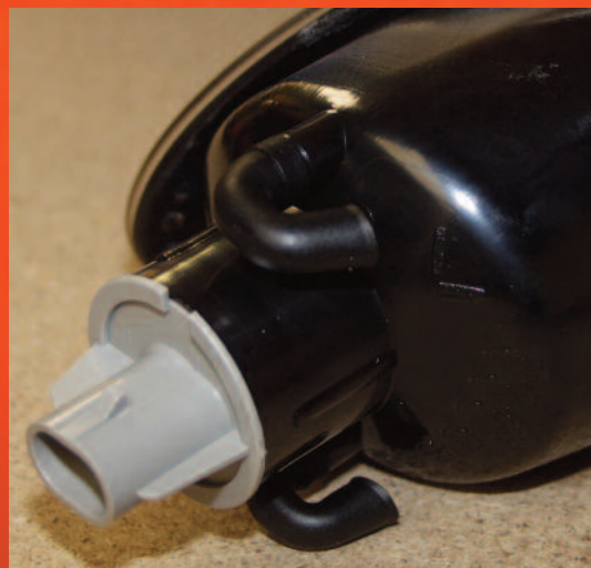
Rear of Indicator showing vent pipes

the pipe is facing sideways or downward, and not upward, as this could allow water to run into the unit.