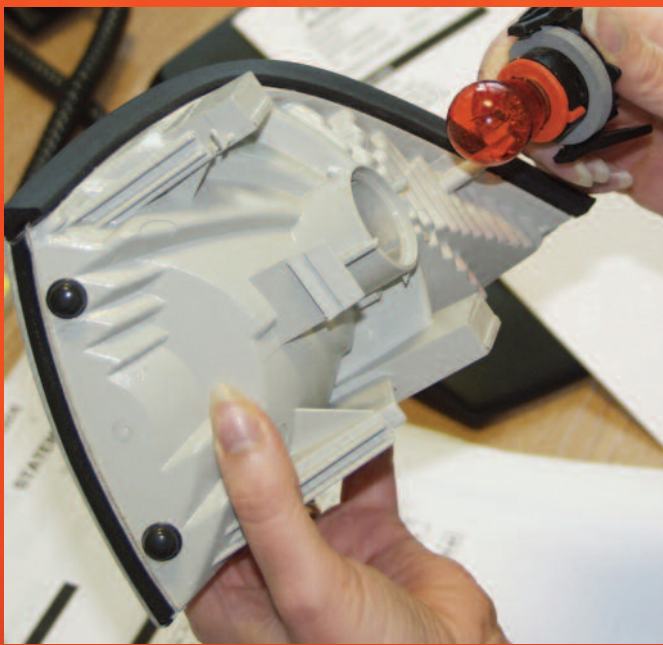
Transferring over an indicator bulbholder

• Some indicator units have vents on the back to allow condensation to evaporate. They often have a U-shaped rubber pipe on them. If they are present, check that the open end of