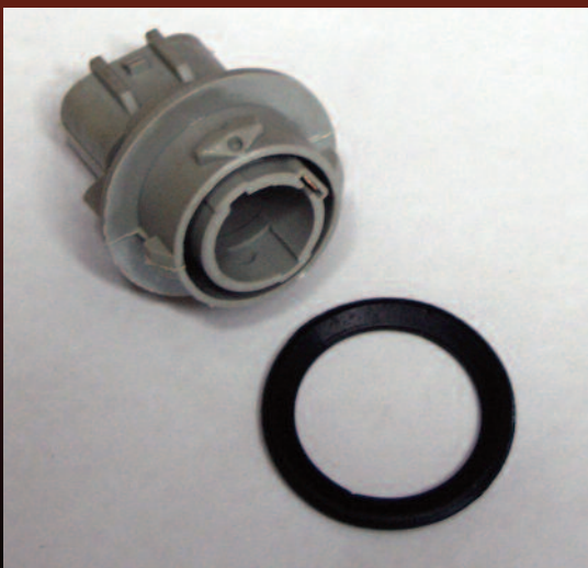
Indicator bulbholder with o-ring

• Always remember - excessive force should not be required. If you're applying lots of pressure and nothing's happening, stop and make sure you're pushing in the right direction before you break something!